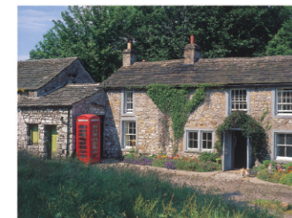
A colourful corner of Arncliffe, one of the loveliest villages in the Yorkshire Dales.